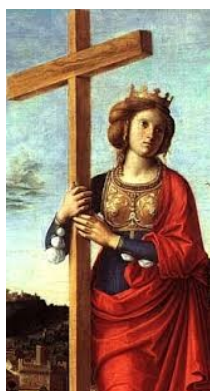
Feast of the Exaltation of the Cross

Extraordinary Form (EF) Masses are said in Latin according to the traditional Missal used before Vatican II, and are